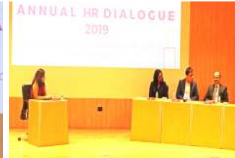
Annual HR Dialogue - Panel Discussion